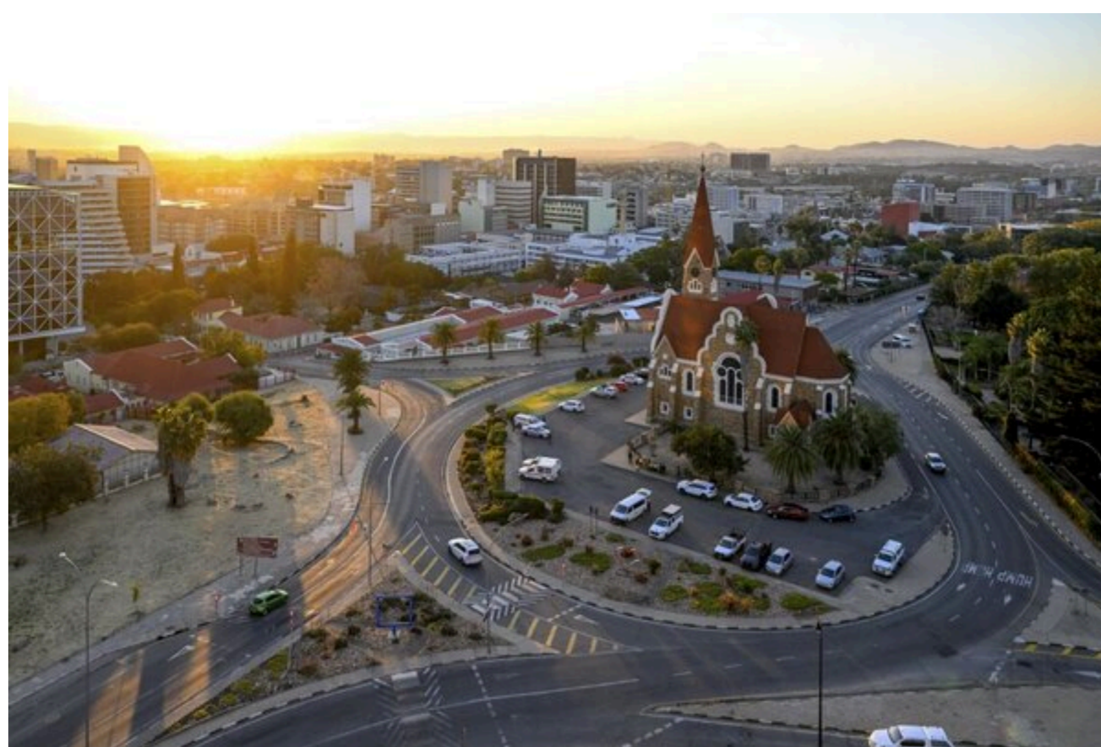
Namibia's central economic hub is the capital Windhoek. Around 537,000 people live in it and the neighboring towns.